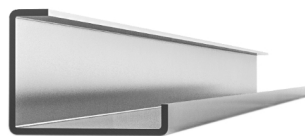
D154 Grubość: 2,0mm