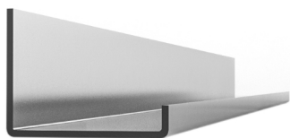
D152 Grubość: 1,5mm